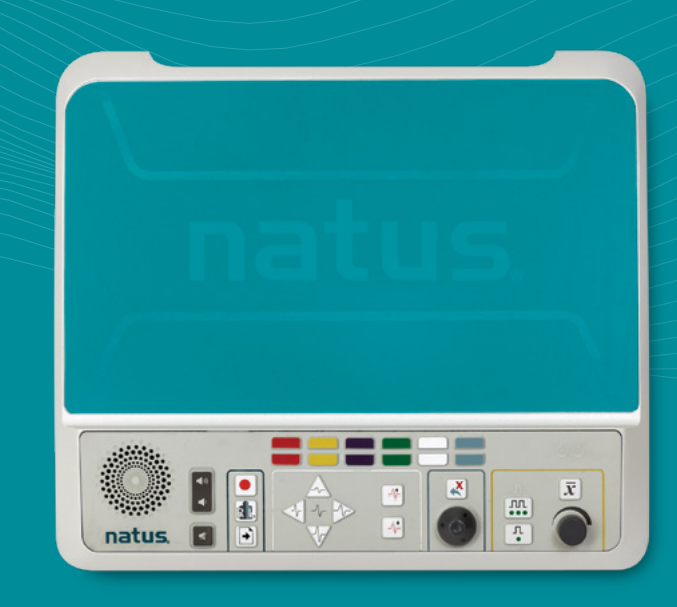
User-friendly, color-coded controls